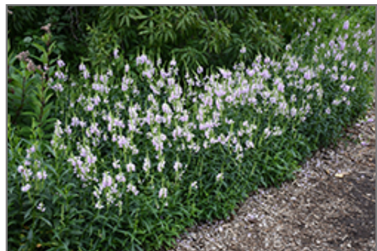
Obedient Plant in bloom