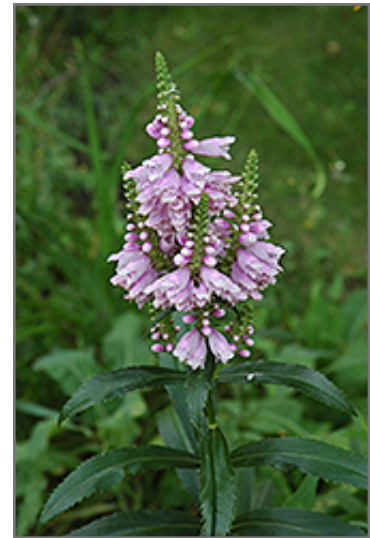
Obedient Plant flowers

Obedient Plant is recommended for the following landscape applications;