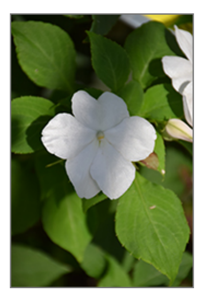
Imara XDR White Impatiens flowers

This series features impressive, high quality blooms on compact branching plants with a high degree of disease resistance; bright white flowers on upright, mounded plants; perfect for shaded beds, borders, and patio containers