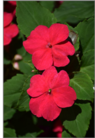
Imara XDR Rose Impatiens flowers

Imara XDR Rose Impatiens is recommended for the following landscape applications;