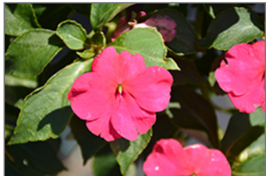
Beacon Rose Impatiens flowers