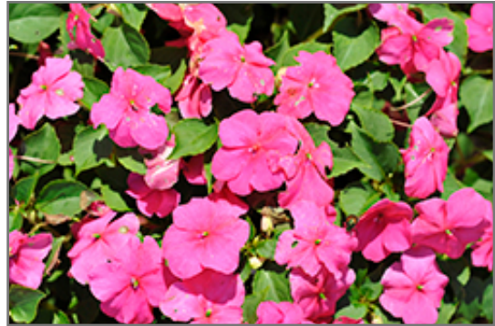
Beacon Rose Impatiens flowers

Beacon Rose Impatiens is recommended for the following landscape applications;