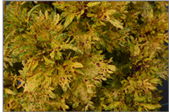
Dream Catcher Coleus foliage