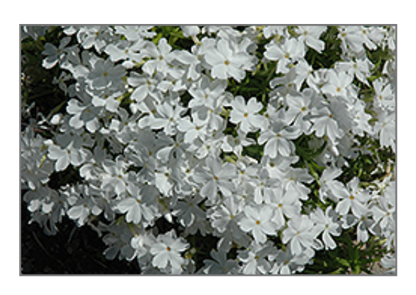
White Delight Moss Phlox flowers