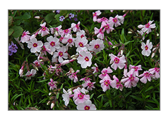
Laura Moss Phlox flowers