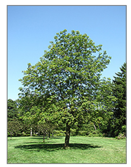
Ohio Buckeye