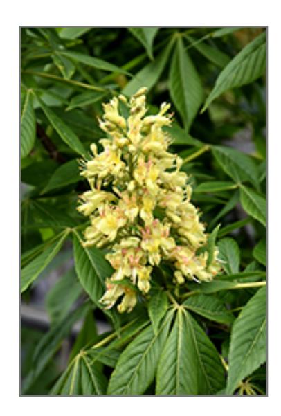
Ohio Buckeye flowers