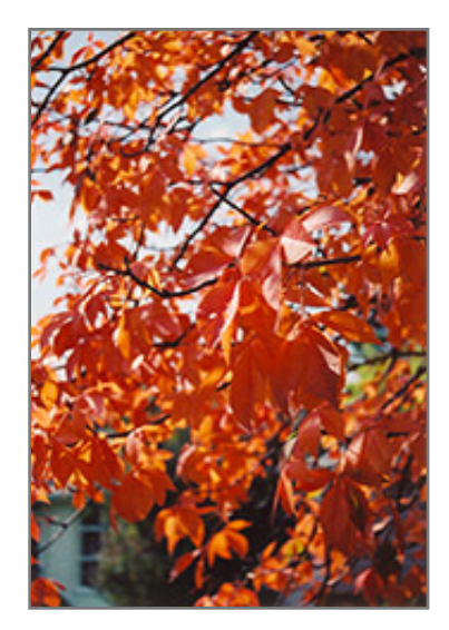
Ohio Buckeye in fall

This tree does best in full sun to partial shade. It prefers to grow in average to moist conditions, and shouldn't be allowed to dry out. It is not particular as to soil type or pH. It is highly tolerant of urban pollution and will even thrive in inner city environments. This species is native to parts of North America.