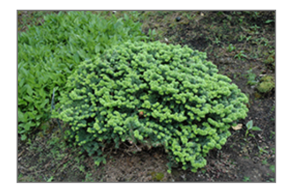
Dwarf Balsam Fir

Dwarf Balsam Fir will grow to be about 24 inches tall at maturity, with a spread of 3 feet. It tends to fill out right to the ground and therefore doesn't necessarily require facer plants in front. It grows at a slow rate, and under ideal conditions can be expected to live for 50 years or more.