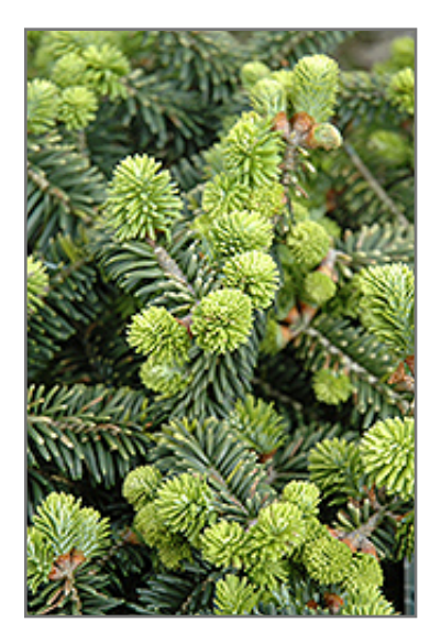
Dwarf Balsam Fir foliage