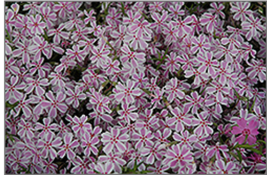
Candy Stripe Moss Phlox flowers