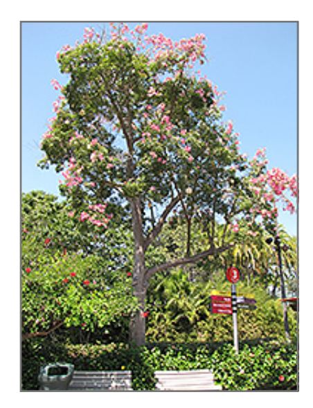
Silk Floss Tree in bloom

This is a relatively low maintenance tree, and should only be pruned after flowering to avoid removing any of the current season's flowers. It has no significant negative characteristics.