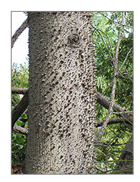
Silk Floss Tree bark

This tree should only be grown in full sunlight. It does best in average to evenly moist conditions, but will not tolerate standing water. It is not particular as to soil type or pH. It is somewhat tolerant of urban pollution. Consider applying a thick mulch around the root zone in both summer and winter to conserve soil moisture and protect it in exposed locations or colder microclimates. This species is not originally from North America.