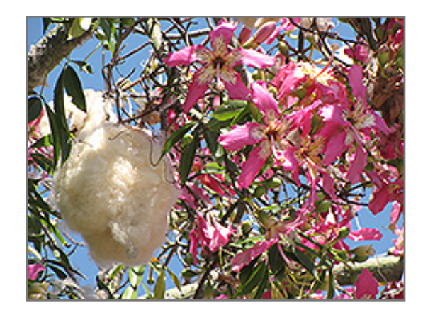
Silk Floss Tree flowers