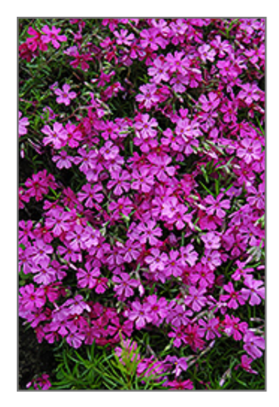
Apple Blossom Moss Phlox flowers

Apple Blossom Moss Phlox is smothered in stunning pink star-shaped flowers at the ends of the stems from early to late spring. Its tiny needle-like leaves remain green in colour throughout the year.