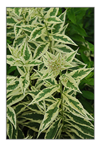
Nora Leigh Garden Phlox foliage

Nora Leigh Garden Phlox features bold fragrant conical white star-shaped flowers with rose eyes at the ends of the stems from early summer to early fall. The flowers are excellent for cutting. Its attractive narrow leaves remain green in colour with showy white variegation throughout the season.