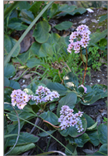
Winter Blooming Bergenia in bloom