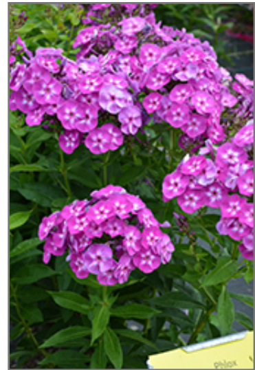
Laura Garden Phlox flowers