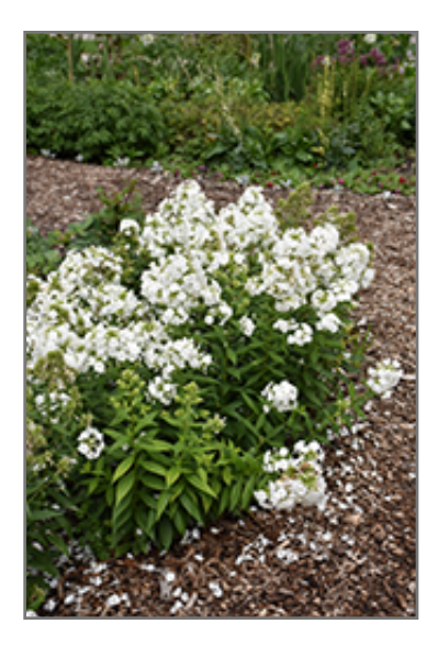
David Garden Phlox in bloom