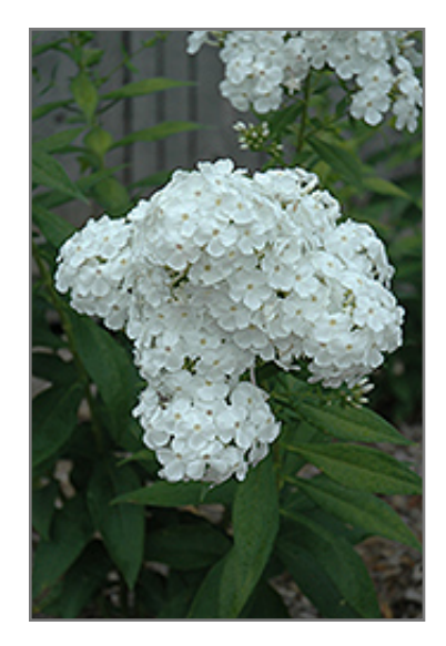
David Garden Phlox flowers