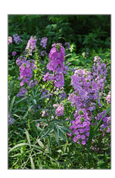
Meadow Phlox flowers

Meadow Phlox is an herbaceous perennial with an upright spreading habit of growth. Its relatively fine texture sets it apart from other garden plants with less refined foliage.