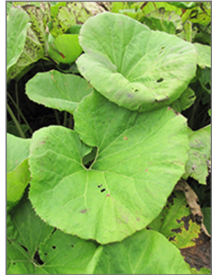
Giant Japanese Butterbur foliage

Giant Japanese Butterbur is recommended for the following landscape applications;