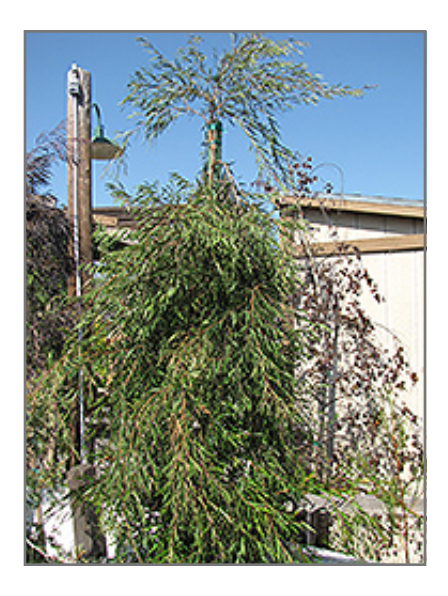
Dwarf Willow Myrtle (standard)