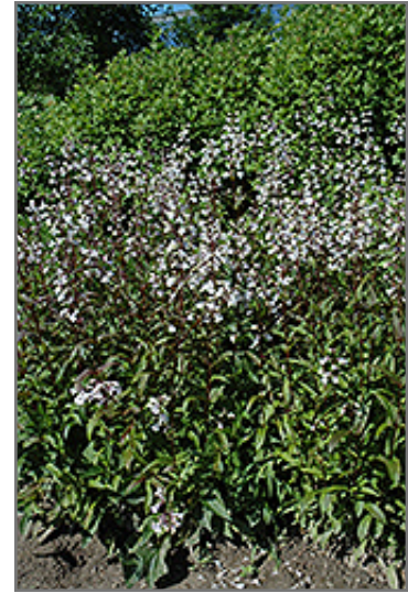
Husker Red Beard Tongue in bloom

Husker Red Beard Tongue is a fine choice for the garden, but it is also a good selection for planting in outdoor pots and containers. With its upright habit of growth, it is best suited for use as a 'thriller' in the 'spiller-thriller-filler' container combination; plant it near the center of the pot, surrounded by smaller plants and those that spill over the edges. Note that when growing plants in outdoor containers and baskets, they may require more frequent waterings than they would in the yard or garden. Be aware that in our climate, most plants cannot be expected to survive the winter if left in containers outdoors, and this plant is no exception. Contact our experts for more information on how to protect it over the winter months.