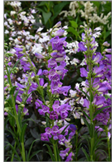
Prairie Dusk Beard Tongue flowers