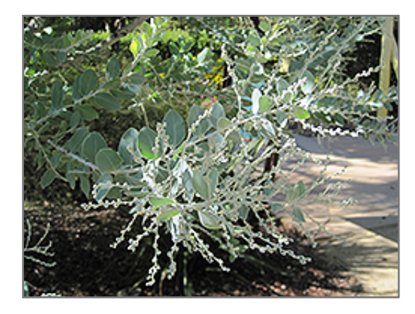
Pearl Acacia foliage