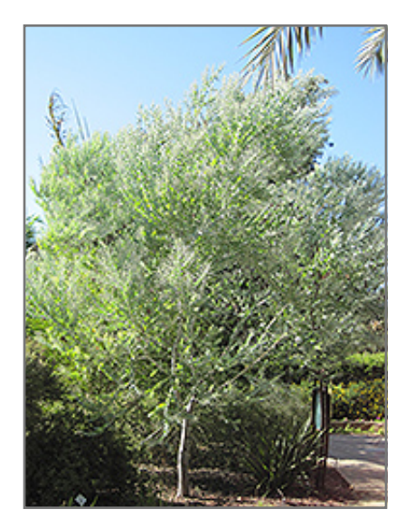
Pearl Acacia

This is a relatively low maintenance tree, and should only be pruned after flowering to avoid removing any of the current season's flowers. Deer don't particularly care for this plant and will usually leave it alone in favor of tastier treats. Gardeners should be aware of the following characteristic(s) that may warrant special consideration;