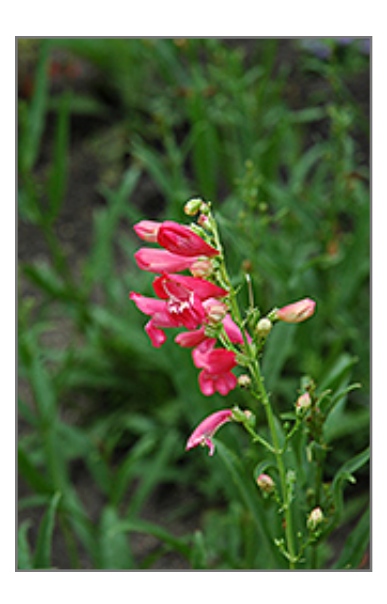
Lilliput Rose Beard Tongue flowers

Lilliput Rose Beard Tongue has masses of beautiful spikes of rose tubular flowers with white throats rising above the foliage from early to late summer, which are most effective when planted in groupings. The flowers are excellent for cutting. Its narrow leaves remain green in colour throughout the season.