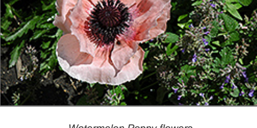
Watermelon Poppy flowers

Watermelon Poppy will grow to be about 24 inches tall at maturity, with a spread of 24 inches. When grown in masses or used as a bedding plant, individual plants should be spaced approximately 18 inches apart. It grows at a fast rate, and under ideal conditions can be expected to live for approximately 5 years. As an herbaceous perennial, this plant will usually die back to the crown each winter, and will regrow from the base each spring. Be careful not to disturb the crown in late winter when it may not be readily seen! As this plant tends to go dormant in summer, it is best interplanted with late-season bloomers to hide the dving foliage.