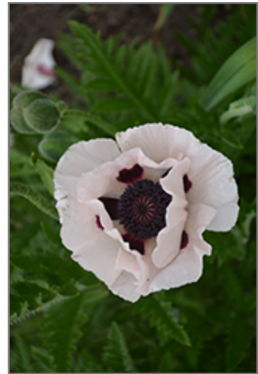
Royal Wedding Poppy flowers