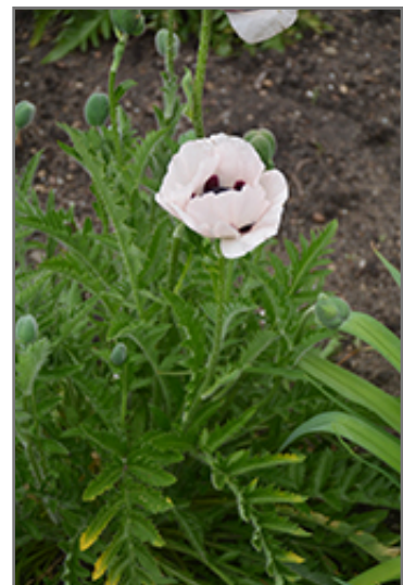
Royal Wedding Poppy in bloom