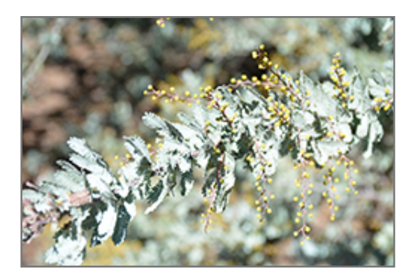
Cootamundra Wattle foliage

This is a relatively low maintenance tree, and should only be pruned after flowering to avoid removing any of the current season's flowers. It is a good choice for attracting birds, bees and butterflies to your yard, but is not particularly attractive to deer who tend to leave it alone in favor of tastier treats. Gardeners should be aware of the following characteristic(s) that may warrant special consideration;