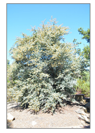
Cootamundra Wattle

Cootamundra Wattle is a multi-stemmed evergreen tree with a shapely form and gracefully arching branches. Its relatively fine texture sets it apart from other landscape plants with less refined foliage.