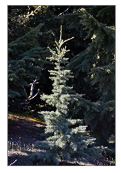
Bump's Blue Mountain Hemlock

Bump's Blue Mountain Hemlock is recommended for the following landscape applications;