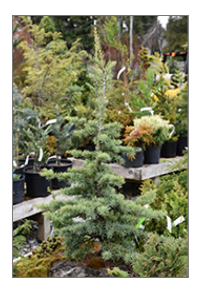
Bump's Blue Mountain Hemlock