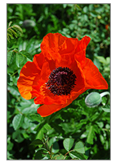
Allegro Poppy flowers

Allegro Poppy features bold tomato-orange round flowers with burgundy eyes at the ends of the stems from early to mid summer. The flowers are excellent for cutting. Its deeply cut ferny leaves remain forest green in colour throughout the season.