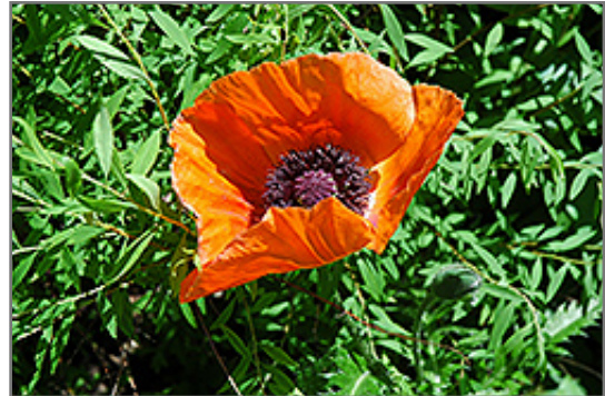
Oriental Poppy flowers