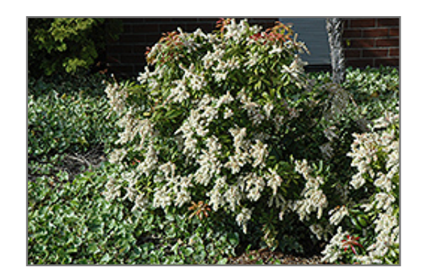
Japanese Pieris in bloom