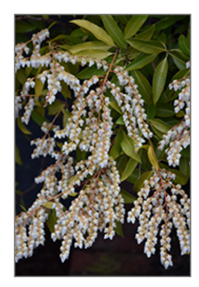
Japanese Pieris flowers

This shrub will require occasional maintenance and upkeep, and should only be pruned after flowering to avoid removing any of the current season's flowers. Deer don't particularly care for this plant and will usually leave it alone in favor of tastier treats. It has no significant negative characteristics.