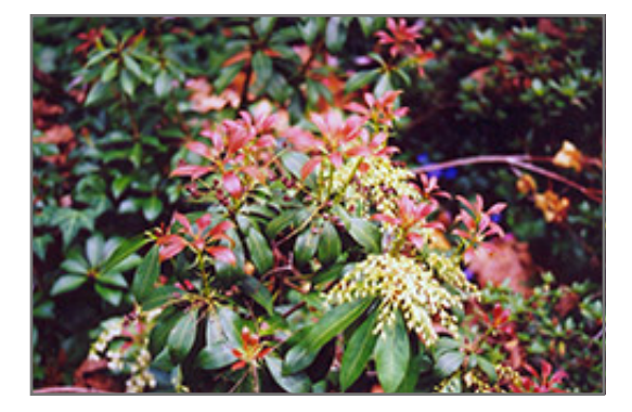
Japanese Pieris foliage

Japanese Pieris will grow to be about 12 feet tall at maturity, with a spread of 7 feet. It tends to be a little leggy, with a typical clearance of 1 foot from the ground, and is suitable for planting under power lines. It grows at a slow rate, and under ideal conditions can be expected to live for 40 years or more.