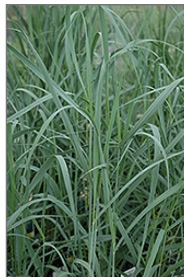
Heavy Metal Blue Switch Grass foliage