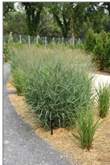
Heavy Metal Blue Switch Grass