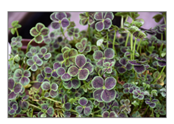
Black-Leaved Clover foliage

A showy form of clover with attractive dark purple-black leaves that are edged in sea-green; the roots of this plant fix nitrogen in the soil; potentially invasive, rooting at the nodes; use where it can roam freely as groundcover, with shrubs or bulbs