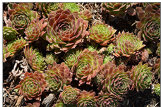
Rocknoll Rosette Hens And Chicks