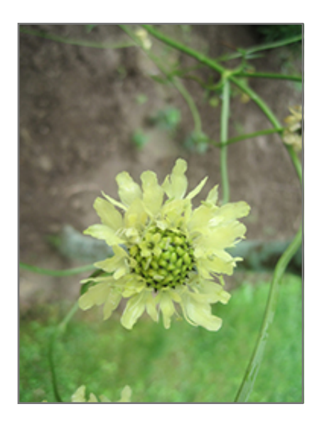
Moon Dance Yellow Pincushion Flower flowers

This variety is a compact, mounding perennial with sturdy stems that bear small, pale yellow button flowers from early summer into fall; long blooming, and has a tidy habit perfect for border fronts, rock gardens, or containers