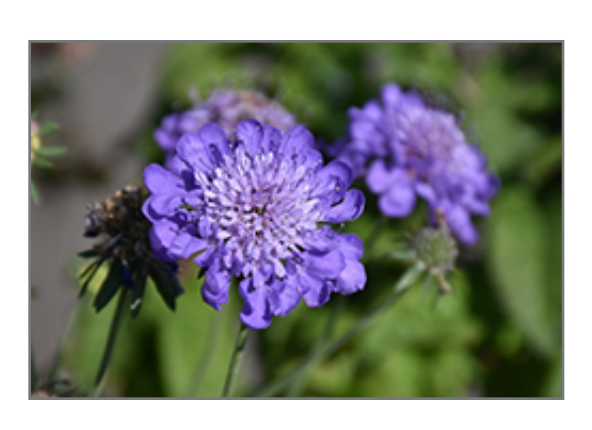
Mariposa Blue Pincushion Flower flowers

This variety is a low tufted or mounding perennial with taller stems that bear small sky blue pincushion flowers that mature to lavender; long blooming and perfect for edging, rock gardens, or containers