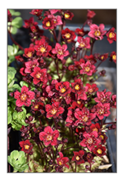
Alpino Red Saxifrage flowers