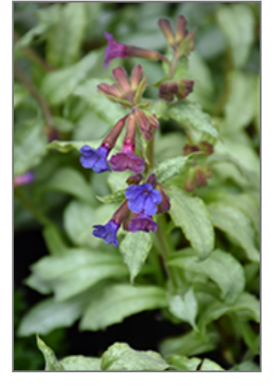
Silver Shimmers Lungwort flowers

A low mounding perennial featuring silvery, undulating leaves with pale green variegation; blue flowers emerge from red buds in spring, then mature to lavender; an attractive accent plant or impressive underplanting for wooded areas