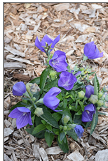
Twinkle Blue Balloon Flower in bloom