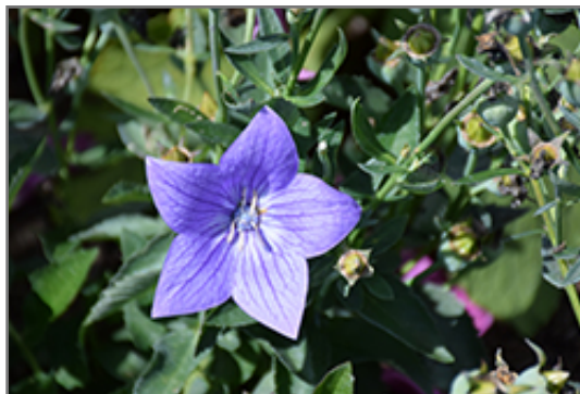
Twinkle Blue Balloon Flower flowers

Twinkle Blue Balloon Flower is recommended for the following landscape applications;