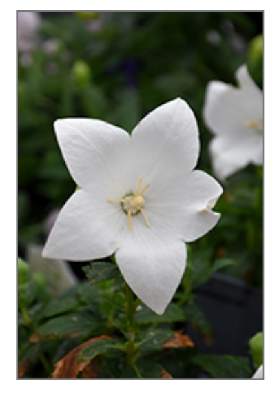
Pop Star White Balloon Flower flowers

This is a relatively low maintenance plant, and is best cleaned up in early spring before it resumes active growth for the season. It has no significant negative characteristics.