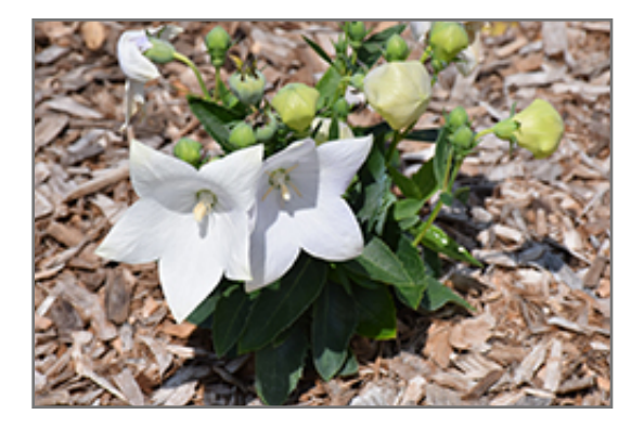
Pop Star White Balloon Flower in bloom

Pop Star White Balloon Flower is recommended for the following landscape applications;