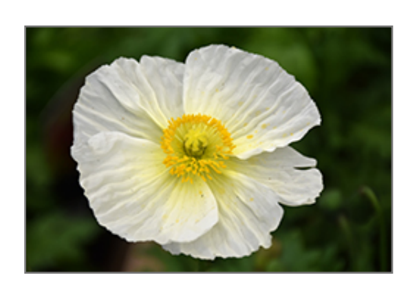
Spring Fever White Poppy flowers

Spring Fever White Poppy is recommended for the following landscape applications;