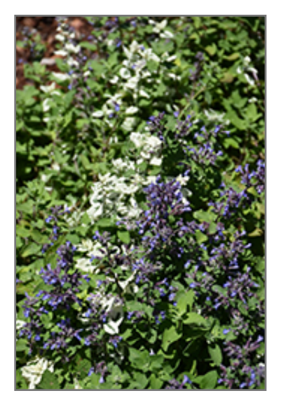
Angel's Wings Catmint flowers

This dense, compact, rounded variety tends to keep its shape all season long; small, variegated gray-green leaves with white margins are topped with spikes of violet-blue flowers; looks great all season in beds and borders