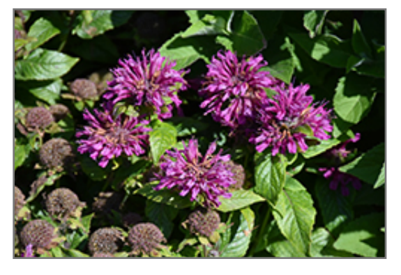
Pocahontas Purple Rose Beebalm flowers

Pocahontas Purple Rose Beebalm is recommended for the following landscape applications;