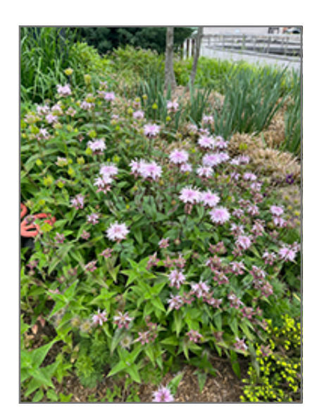
Eastern Beebalm in bloom