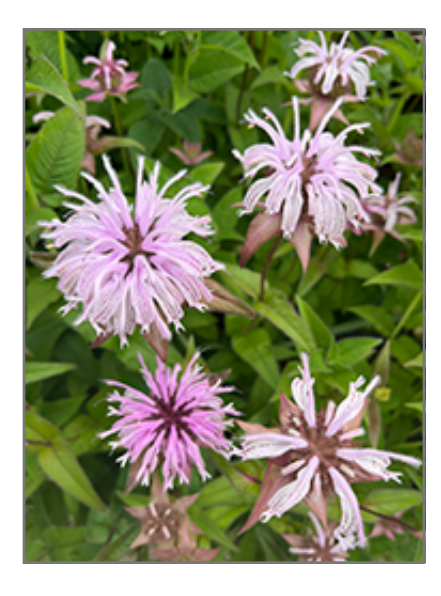
Eastern Beebalm flowers

This plant will require occasional maintenance and upkeep, and should be cut back in late fall in preparation for winter. It is a good choice for attracting bees, butterflies and hummingbirds to your yard, but is not particularly attractive to deer who tend to leave it alone in favor of tastier treats. Gardeners should be aware of the following characteristic(s) that may warrant special consideration;