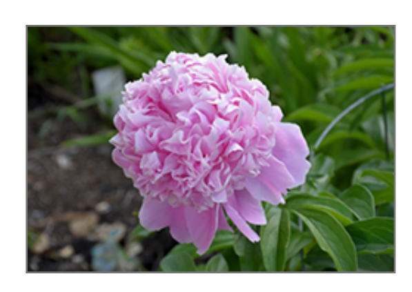
Sarah Bernhardt Peony flowers

Sarah Bernhardt Peony features bold fragrant double shell pink flowers at the ends of the stems from late spring to early summer. The flowers are excellent for cutting. Its compound leaves remain green in colour throughout the season.