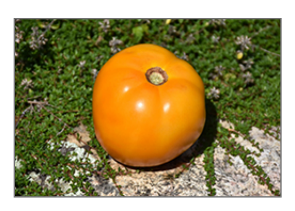
Sunny Boy Tomato fruit

A fantastic variety, producing high yields of large, sunshine yellow, flattened globe shaped fruit on indeterminate plants; well balanced, meaty and fleshy, these tomatoes are ideal for slicing, canning, sauces and salads; staking or caging is recommended