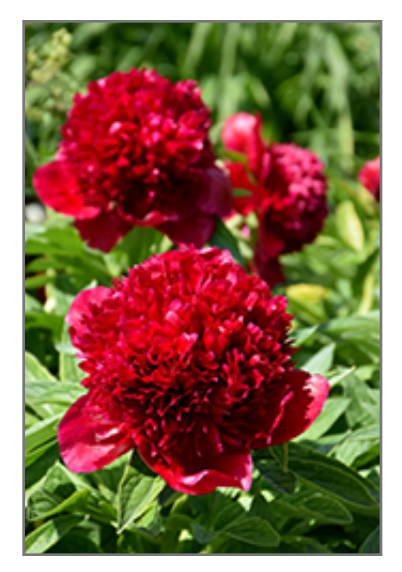
Red Charm Peony flowers

Red Charm Peony will grow to be about 30 inches tall at maturity, with a spread of 3 feet. When grown in masses or used as a bedding plant, individual plants should be spaced approximately 30 inches apart. The flower stalks can be weak and so it may require staking in exposed sites or excessively rich soils. It grows at a slow rate, and under ideal conditions can be expected to live for approximately 20 years. As an herbaceous perennial, this plant will usually die back to the crown each winter, and will regrow from the base each spring. Be careful not to disturb the crown in late winter when it may not be readily seen!