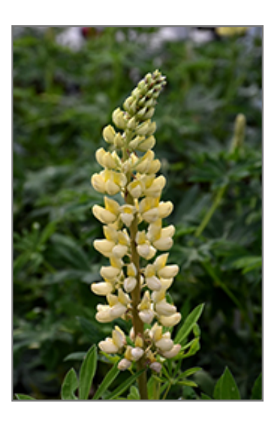
Chandelier Lupine flowers

A vivid, gorgeous selection, producing thick spikes of eye catching blooms in shades of yellow and cream; a tremendous visual impact massed in the garden, border plantings or in containers