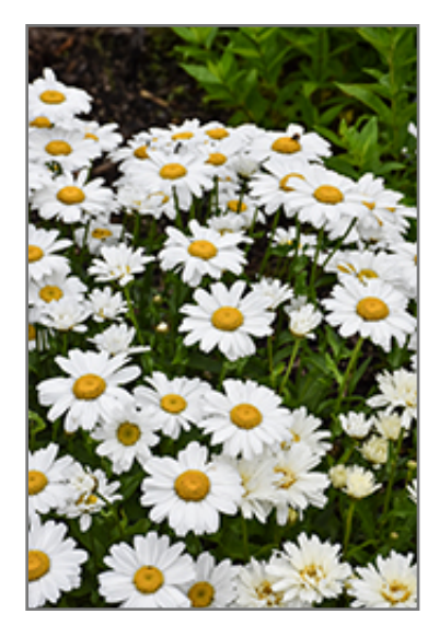
Sweet Daisy Christine Shasta Daisy flowers

Sweet Daisy Christine Shasta Daisy is recommended for the following landscape applications;