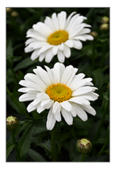
Sweet Daisy Christine Shasta Daisy flowers