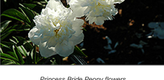
Princess Bride Peony flowers

Princess Bride Peony will grow to be about 30 inches tall at maturity, with a spread of 3 feet. When grown in masses or used as a bedding plant, individual plants should be spaced approximately 30 inches apart. The flower stalks can be weak and so it may require staking in exposed sites or excessively rich soils. It grows at a slow rate, and under ideal conditions can be expected to live for approximately 20 years. As an herbaceous perennial, this plant will usually die back to the crown each winter, and will regrow from the base each spring. Be careful not to disturb the crown in late winter when it may not be readily seen!