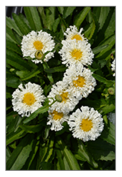
Realflor Real Snowball Shasta Daisy flowers

An outstanding variety producing gorgeous white, fully double blooms with golden centers, rising up on strong stems; very floriferous with improved disease resistance; a beautiful addition to the garden or border when massed